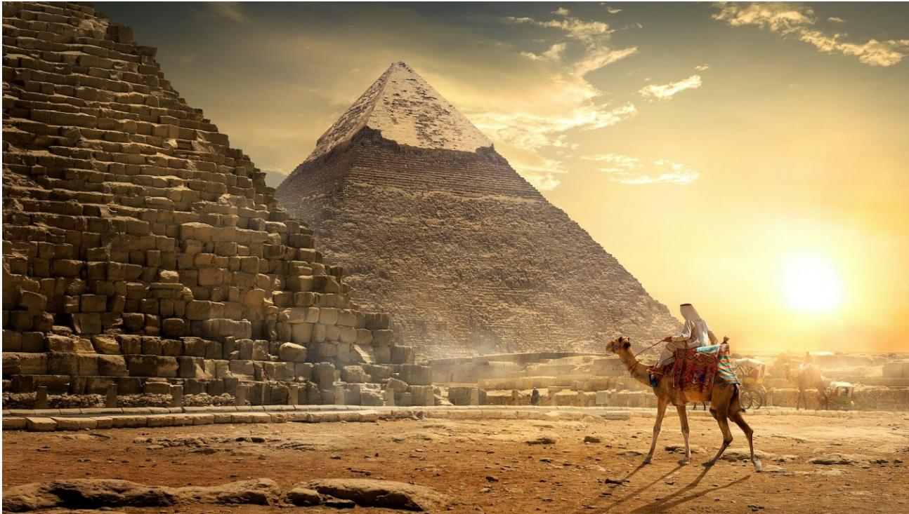
Day 01: Arrival Cairo