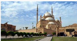
Day 04: Full day tour (B)