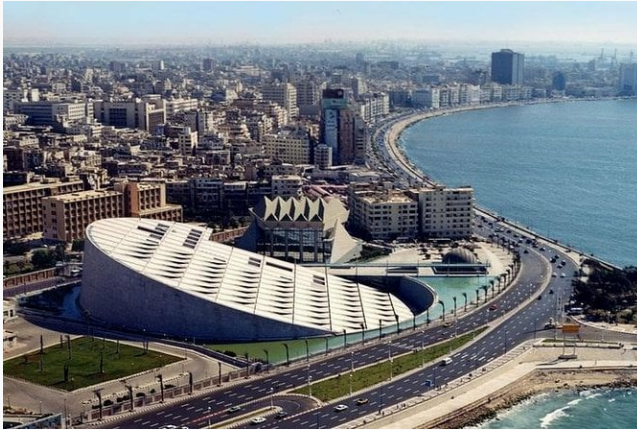
Day 03: Overday Alexandria (B)

Early breakfast at the hotel in Cairo then transfer to Alexandria via the desert road –about 225 km– whereby you will start a guided tour to visit the Roman Amphitheater, Catacomb, Pomp Pillar & outside photostop at Qait Bay Citadel.